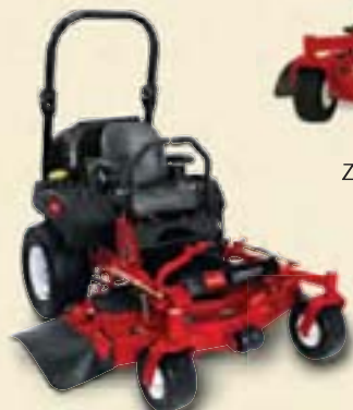
Z Master Z580 and Z590 Series Liquid-Cooled Gas and Diesel Models