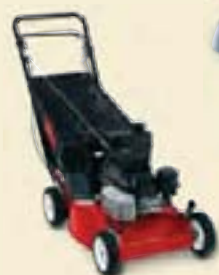
21" Commercial Walk-Behind Mowers