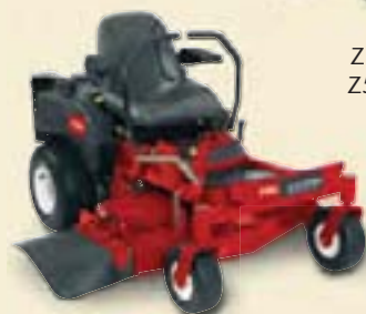
Z Master Z300 Series Sub-Compact Models