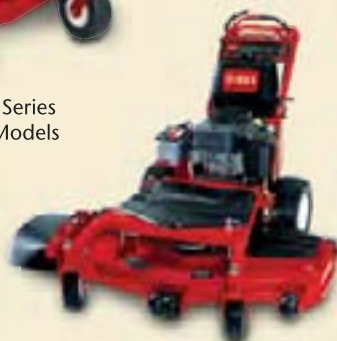
Mid-Size Walk-Behind Mowers

See your local Toro dealer or visit toro.com/professional for more information.