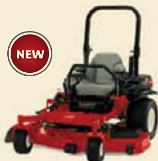
Z Master® G3 Models